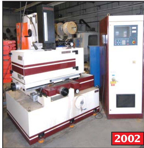
SURE FIRST ZPNC-408 CNC sink type edm