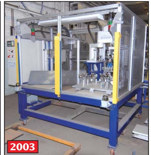
TOSHIBA SR-654HSP assembly cell