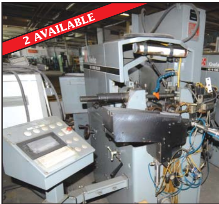
KINEFAC MC-10 KINE ROLLER two cylindrical die rolling machines