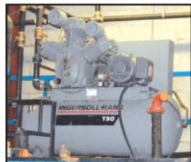
INGERSOLL RAND T30 air compressor