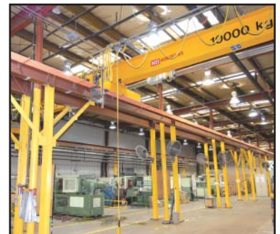
25 ft span x 225 ft free standing crane structures

Please register online 24 hours in advance to qualify to bid via webcast!