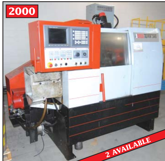
EMCO MAIER TURN 345 CNC turning centers

(2) KONECRANES 10,000 kg overhead bridge cranes with CXT 500 under slung hoist, 25 ft span x 225 ft free standing crane structure, bussbar, rails, pendant control (may be sold separately), s/n na