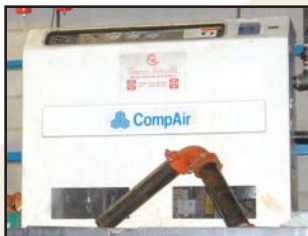
COMPAIR refrigerated air dryer