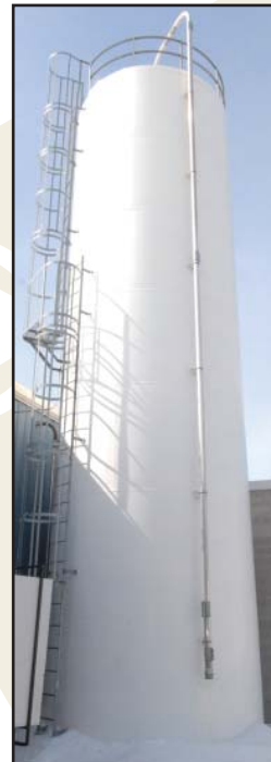
Silo approx. 50 ft H x 12 ft diameter