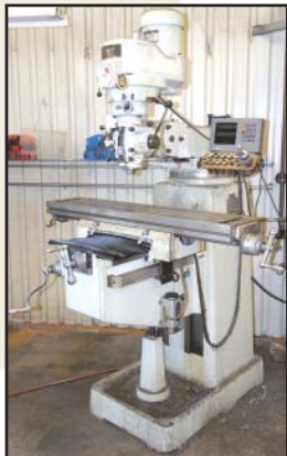
FIRST LC-185VS ram type turret mill