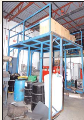
Mezzanine 10 ft x 12 ft x 9 ft H