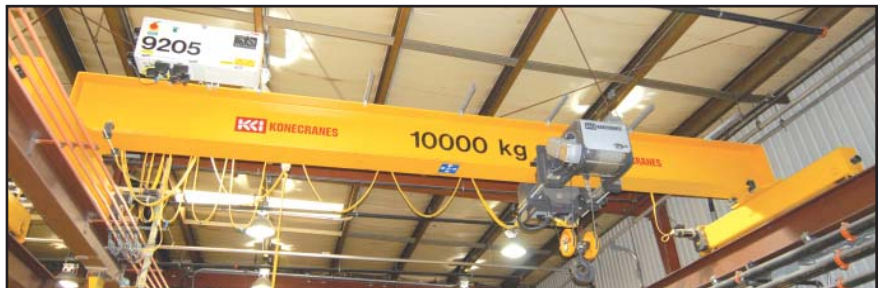
KONECRANES 10,000 kg overhead bridge cranes