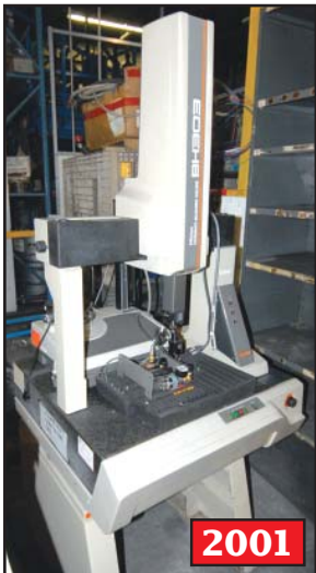
MITUTOYO CMM BH303 CMM