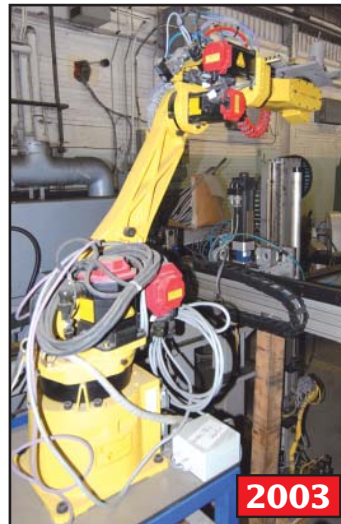
FANUC M-6iB 6-axis robot