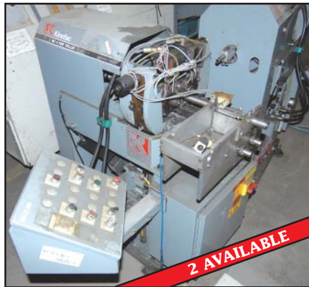
KINEFAC MC-4 KINE ROLLER two cylindrical die rolling machines