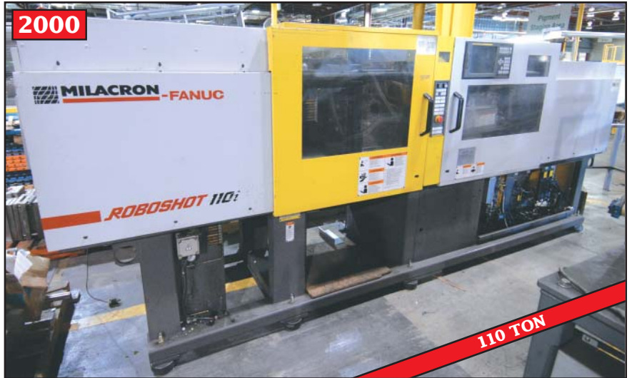
MILACRON-FANUC ROBOSHOT 110iA injection molding machine

BATTENFELD 1991, BK-T-1800/800 plastic injection molding machine with 180 ton x 552 CCM capacity, 20.2" x 20.2" between tie bars, 9.8" min. daylight, UNILOG 4000 control, s/n 47638