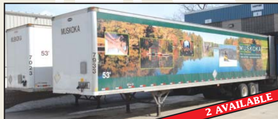
53 ft dual axle trailers