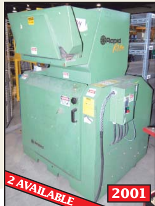
RAPID RAGE granulators