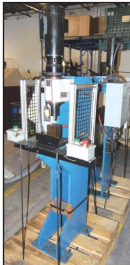
ORBITFORM B-250 riveters