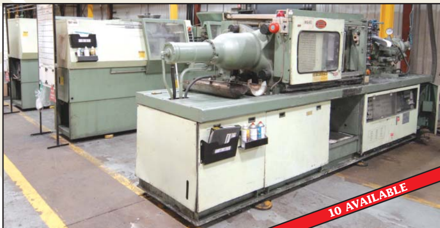
BATTENFELD & NISSEI injection molding machines

KING PDM gear head drill with 2,500 rpm, s/n 732471