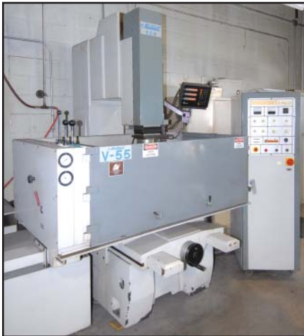
MAXIMART V-55 sink type edm

TOSHIBA 2003 , SR-654HSP portable robotic assembly cell, s/n na