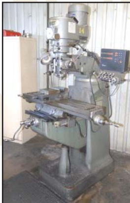
FIRST LC-1 1/2VS ram type turret mill