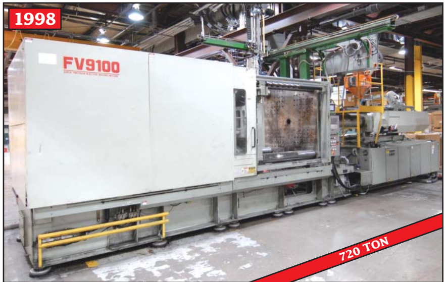
NISSEI FV9100 SUPER PRECISION injection molding machine