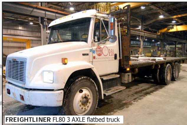
FREIGHTLINER FL80 3 AXLE flatbed truck