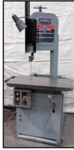
KING 14" roll-in saw