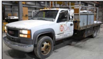
GMC SIERRA 3500HD flat bed truck