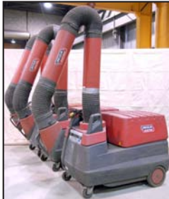
LINCOLN MOBIFLEX 200M portable fume extractors