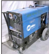
MILLER gas powered welder/generator