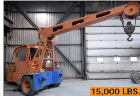
HYSTER outdoor diesel boom crane