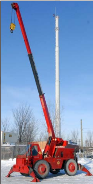
GALEON 16,000 lbs. all terrain diesel mobile crane