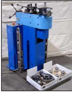
CBC UNI70 digital tube bending machine