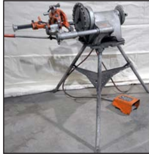
RIDGID 300 power threader