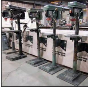
Partial view of drill presses available

KING KC-914H, 14" roll-in type vertical band saw s/n n/a