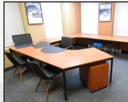
Partial view of office furniture available