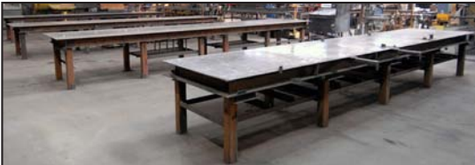
Partial view of steel tables available