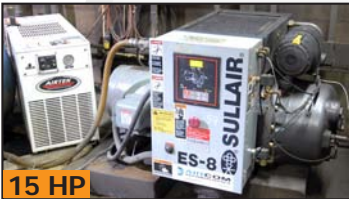
15 HP SULLAIR air compressor & AIRTECH air dryer