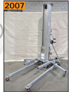
2007 GENIE SLC-24 portable folding telescopic lift