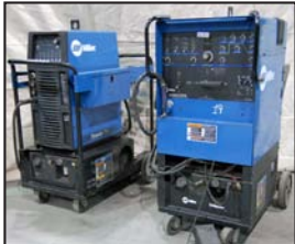
Partial view of MILLER TIG welders