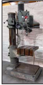
MODIG RBM28B, 2' radial arm drill