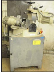
VITRODODI tool grinder