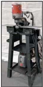
NITTO KOHKI SC-05 punch