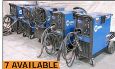
Partial view of MILLER 251 MIG welders

THINKING OF HAVING A SALE? CONTACT CORPORATE ASSETS INC.