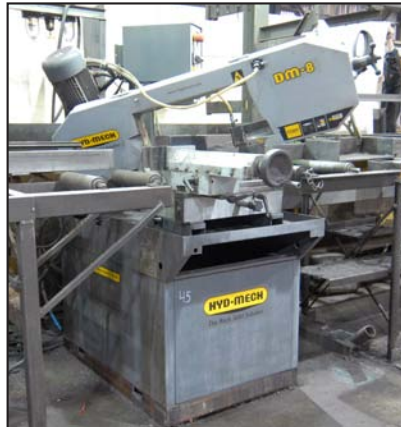
HYD MECH DM8 double mitre horizontal band saw