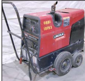
LINCOLN RANGER 250 gas welder/generator