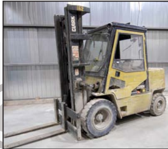
CLARK GPX40, 8000 lbs. outdoor diesel forklift