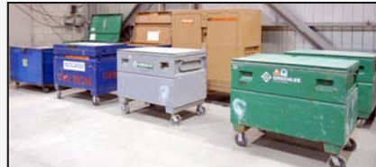
Partial view of job boxes available