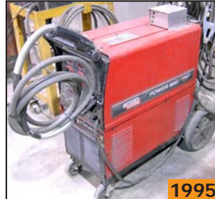
LINCOLN POWERMIG 350 MP MIG welder