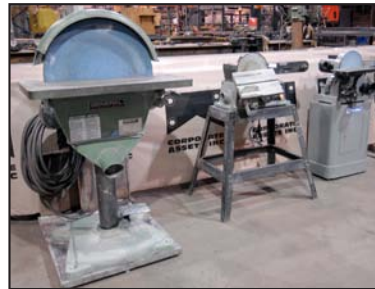
Partial view of disk sanders available