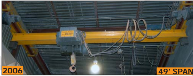
2006 JMF 5 ton single girder bridge crane