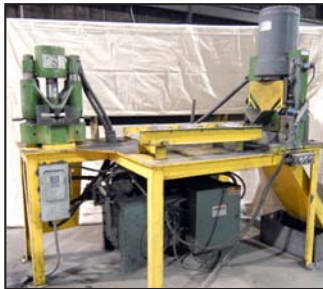
WA WHITNEY 609-250 hydraulic angle shear