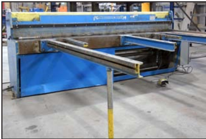
EDWARDS 3.25/2500/DD mechanical shear