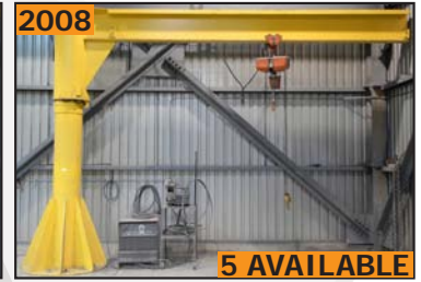
2008 JMF 1.5 ton cap freestanding jib arm with electric hoists